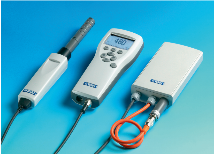
The Vaisala CARBOCAP® Hand-Held Carbon Dioxide Meter GM70 is the demanding professional's choice for hand-held carbon dioxide measurement. The meter consists of the indicator (center) and probe, used either with the handle (left) or pump (right).

The Vaisala CARBOCAP® Hand-Held Carbon Dioxide Meter GM70 is a user-friendly meter for demanding spot measurements in laboratories, greenhouses and mushroom farms. The meter can also be used in HVAC and industrial applications, and as a tool for checking fixed CO 2 instruments.